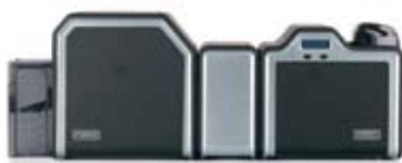
Lamination option and dual-sided printer/encoder