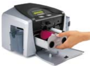
DTC400e single-sided printer

Designed for easy operation and hassle-free maintenance. The Fargo DTC400e features an all-in-one ribbon cartridge that combines a printer ribbon and card cleaning roller into one convenient unit. Just slide in the cartridge, close the door, and you're done. No feeding or tearing ribbon rolls, no fumbling with separate cleaning rollers. The integrated cartridge ensures that you'll change the cleaning roller with every ribbon change — a critical step to ensuring high-quality printing of conventional and rewritable cards.